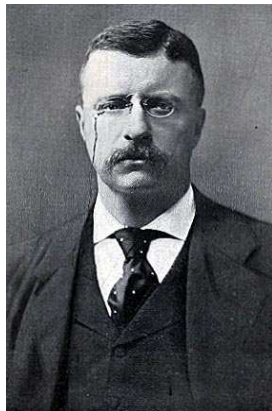
Theodore Roosevelt circa 1900

Among Theodore Roosevelt's greatest contributions to America was his work for conservation. During his seven and a half years as our twenty-sixth President, he provided federal protection for almost 230 million acres, a land area equivalent to that of all the East coast states from Maine to Florida. He designated 150 National Forests, the first 51 Federal Bird Reservations, 5 National Parks, the first 18 National Monuments, the first 4 National Game Preserves, and the first 21 Reclamation Projects.