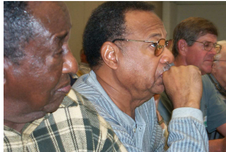
A few of the 200+ Williamston Summit participants