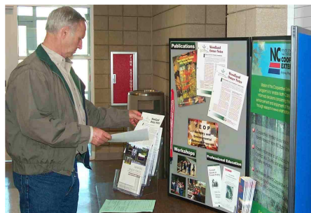
One of the many NC Cooperative Extension Service exhibit visitors at the Summits